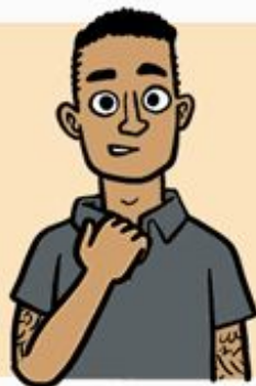
THE HAND ON HEART