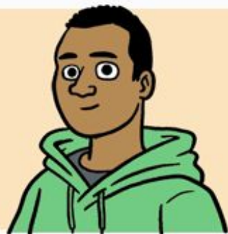
THE 'EAST COAST WAVE'