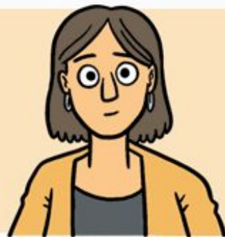
THE 'WHAT A WORLD EH?'