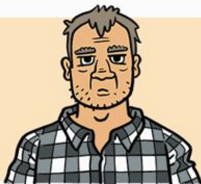
THE 'ALL GOOD' NOD