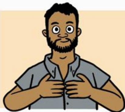
NZSL: HOW ARE YOU?