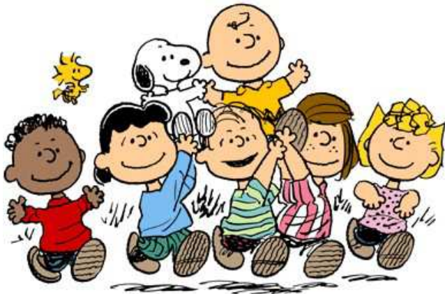
Kids to Career!